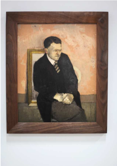
(Portrait of my father, 1955)