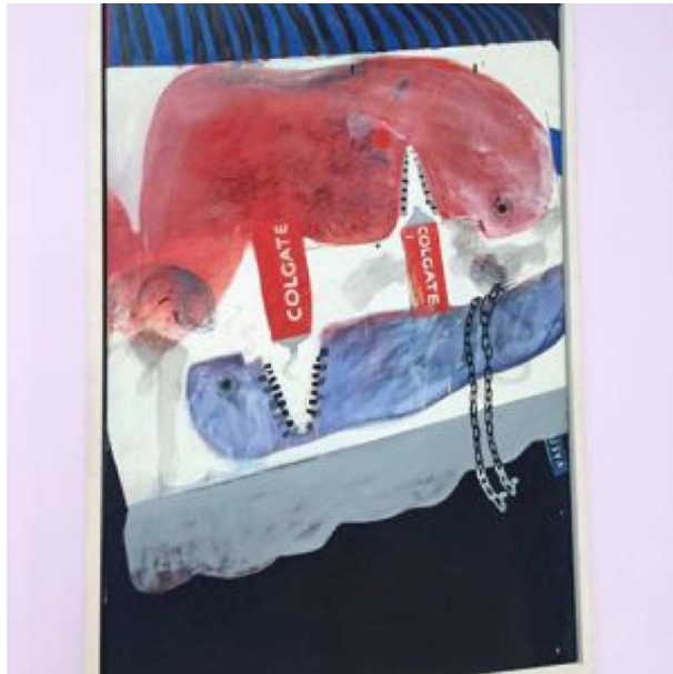
(Cleaning Teeth, Early Evening, 1962)